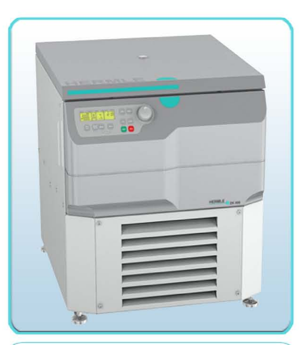
Z496-K Underbench model