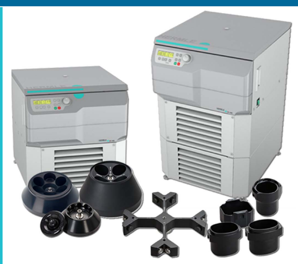
The Z496-K centrifuges offer the highest tube/bottle capacity in our range.

Power Draw: 2300 W Temp Range: -20° to 40° C