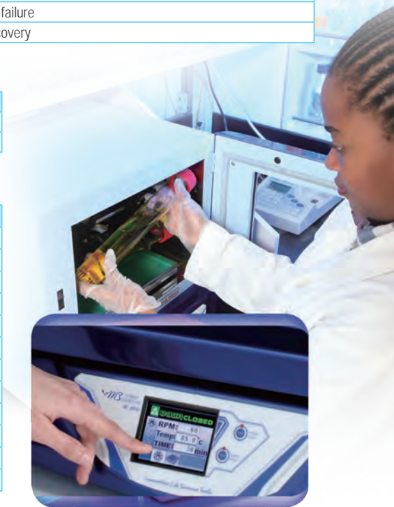
Touch screen & graphical control interface