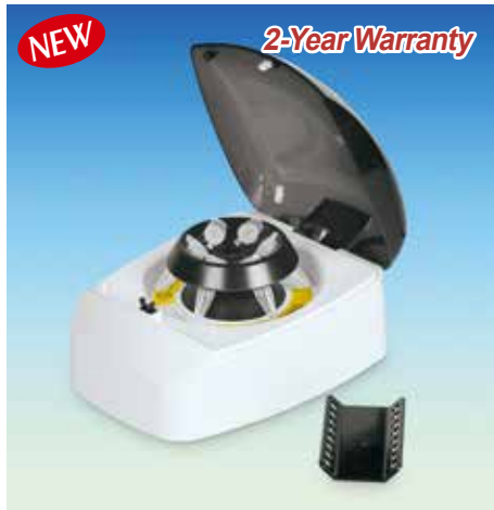
Mini-microcentrifuge Set “MaXpin C-6mt” with Circular Fixed Angle Rotor

DAIHAN-brand® New-generation Mini-microcentrifuge Set “MaXpin C-6mt”, Max. 5,500 rpm, Rapidly Stop Spin-motion for safety with Circular Fixed-Angle Rotor for 6 \times 0.2/0.5/1.5/2.0\text{ml} Tubes and Strip Rotor for 2 \times 0.2\text{ml} PCR 8-tubes Strips/ 16 \times 0.2\text{ml} PCR Tubes 미니-마이크로 원심분리기 세트, 신속한 회전동작 정지, 앵글-/스트립-로터 포함, 0.2/0.5ml 튜브 어댑터 포함 NEW