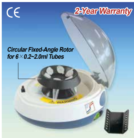
Mini-microcentrifuge Set “CF-5” with Circular Fixed Angle Rotor

DAIHAN-brand® High performance Mini-microcentrifuge Set “CF-5”, Max. 5,500 rpm, with Certi. & Traceability with Circular Fixed-Angle Rotor for 6 \times 0.2/0.5/1.5/2.0\text{ml} Tubes and Strip Rotor for 2 \times 0.2\text{ml} PCR 8-tubes Strips/ 16 \times 0.2\text{ml} PCR Tubes 미니-마이크로 원심분리기 세트, 앵글-/스트립-로터 포함, 0.2/0.5ml 튜브 어댑터 포함