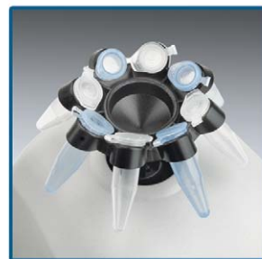
Unique Multi-Head allows for standard vortexing, PLUS holds up to 8 microtubes