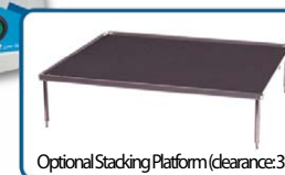
Optional Stacking Platform (clearance: 3")

The BenchRocker 2D is designed to provide the precise speeds and tilt angles required for a broad range of molecular and biological mixing applications. The user can adjust both parameters to match the vessel size and the volume of liquid being mixed, yielding optimum results.