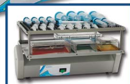
BR1000 with BR1000-STACK