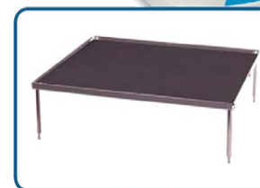
Optional Stacking Platform (clearance: 3")

The BenchRocker 3D is designed to provide the precise speeds and tilt angles required for a broad range of molecular and biological mixing applications. The user can adjust both parameters to match the vessel size and the volume of liquid being mixed, yielding optimum results. Proprietary Insta-Tilt™ technology means no tools, no disassembly. Simply grip the platform with two hands and move to the desired position.