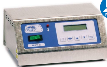
Electronic controller RAT-2

Temperature range from 45 °C to 450 °C. Memory for 20-4 steps programs. Maximum time per step: 600 minutes. Acoustic indication for digestion end of program. Two selectable temperature gradients: kjeldahl/D.Q.O. Temperature sense breakage alarm. Independent control of safety maximum temperature. Bidirectional RS-232 serial connection. For temperature registration and digestion program edition with the RAT connected to a PC. Software included.