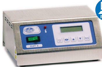
Electronic controller RAT-2

Temperature range from 45 °C to 450 °C. Memory for 20-4 steps programs. Maximum time per step: 600 minutes. Acoustic indication for digestion end of program. Two selectable temperature gradients: kjeldahl/D.Q.O. Temperature sense breakage alarm. Independent control of safety maximum temperature. Bidirectional RS-232 serial connection. For temperature registration and digestion program edition with the RAT connected to a PC. Software included.