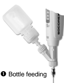
1 Bottle feeding