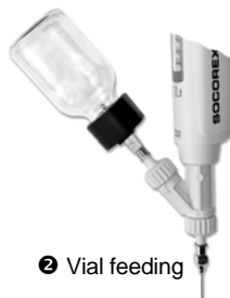
2 Vial feeding