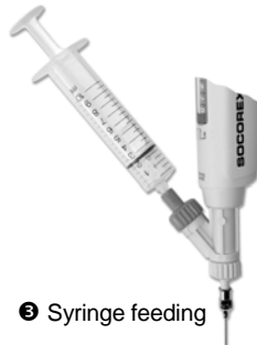
3 Syringe feeding